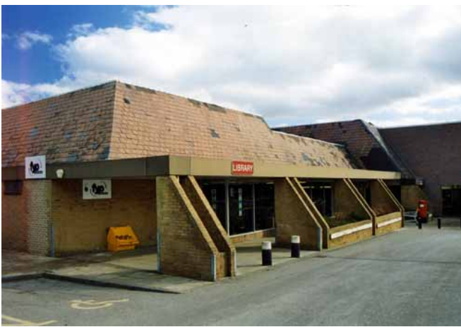
Caption: Moor Allerton Hub which is currently undergoing a revamp